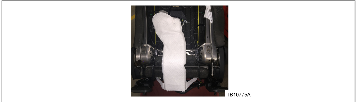
Figure 2 - Article 15-0144