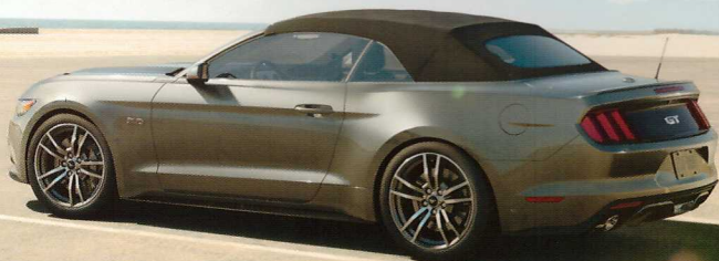
Convertible model: top closed

Mustang's full-throttle power is designed to deliver pure exhilaration and its sleek body style designed to get you noticed.