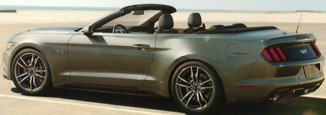
Convertible model: top open