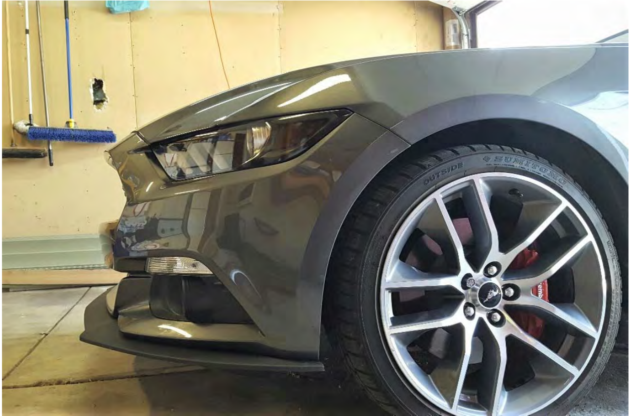
All finished. Total time was less than 2 hours.