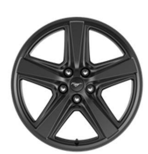
★19" X 9.5" (F) 19" X 10" (R) Tamished Dark-painted Low Gloss Aluminum Standard on 600A and 700A