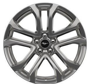
20" X 9" Premium-painted Aluminum (649) Available on (200A – 201A) and (400A – 401A)