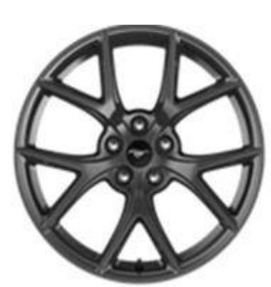
★19" X 9.5" (F) 19" X 10" (R) Magnetic-painted Aluminum (64S) Available on (600A – 700A)