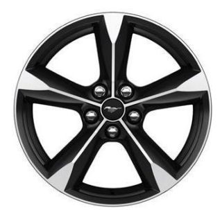
18" X 8" Machined-face Aluminum with Low-gloss Ebony Black-painted pockets (641) Available on (100A – 101A), (300A – 301A)