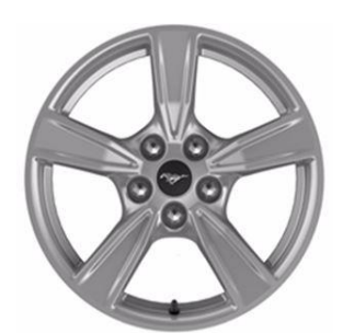
17" X 7.5" Sparkle Silverpainted Aluminum Standard on 100A