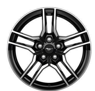
18" X 8" Machined-face Aluminum with High gloss Ebony Black-painted pockets Standard on (101A – 401A)