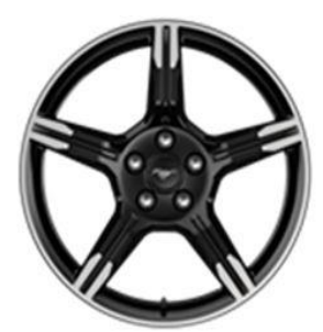
19" X 8.5" Machined-face Aluminum with Ebony Blackpainted pockets Available on California Special Package