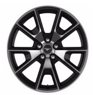
19" X 9" Machined-face Aluminum with Low Gloss Ebony painted pockets Included in 2.3L High Performance Package (67E)