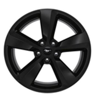
★19"X 8.5"Ebony Blackpainted Aluminum Included in Black Accent Package (60G)