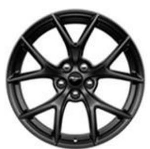
19" X 9.5" Magnetic-painted Aluminum Included in EcoBoost® Handling Package (60H)