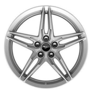
19" X 9" Luster Nickel-painted Forged Aluminum (64L) Available on 2.3L High Performance Package (67E)

19" X 9" (F) 19" X 9.5" (R) Luster Nickel-painted Forged Aluminum (647) Available on GT Performance Package (67G)