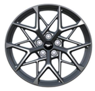
★19" x 10.5" (F) 19" X 11" (R) Tamished Dark-painted Aluminum Available on the Handling Package (60K)