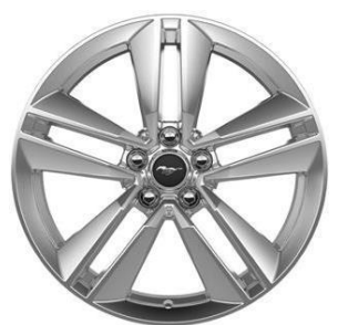
19" X 8.5" Polished Aluminum (64P) Available on (101A), (200A-201A), and (400A-401A) Included in Pony Package (54P)

19" X 9" (F) 19" X 9.5" (R) Luster Nickel-painted Forged Aluminum (647) Available on GT Performance Package (67G)