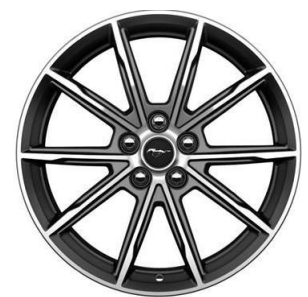
19" X 8.5" Machined-face Aluminum with Low Gloss Ebony-painted pockets Included in Wheel & Stripe Pkg. (60L)