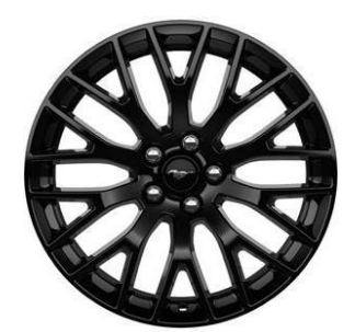
19" X 9" (F) 19" X 9.5" (R) Ebony Black-painted Aluminum Included in GT Performance Package (67G)