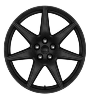
20" Exposed Carbon Fiber Included in Carbon Fiber Track Package (67J)