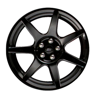
19" x 11" (Front) 19" x 11.5" (Rear) Ebony Black-painted Carbon Fiber Wheel with Red Brake Calipers (Standard 920A)