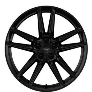
20" Flow-formed High-Gloss Black Aluminum (Standard 950A)