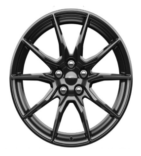
19" x 10.5" (Front) 19" x 11" (Rear) Ebony Black-painted Aluminum (Standard 900A)