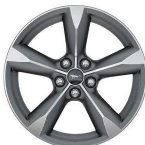
18" X 8" Foundry Black 2 painted Machined-aluminum (641) Standard on Mustang V6 (051A) Optional on EcoBoost® (100A), EcoBoost® Premium (200A/201A), GT (300A) and GT Premium (400A/401A)