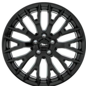
19" X 9" (F) 19" X 9.5" (R) Ebony Black-painted Aluminum Included in GT Performance Package (67G)