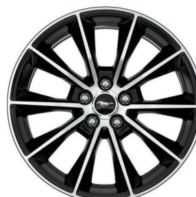
19" X 8.5" Low-gloss Black-painted Machined-aluminum Optional on (100A) (300A) Included in Wheel & Stripe Pkg. (60W) Included in Interior & Wheel Pkg. (601)