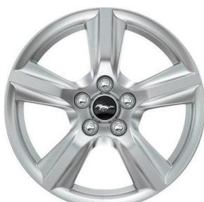
17" X 7.5" Sparkle Silver-painted Aluminum Standard on Mustang V6 (050A)