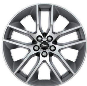
20" X 9" Foundry Black 1 painted Machined-aluminum (649) Optional on EcoBoost® Premium (200A/201A) and GT Premium (400A/401A)