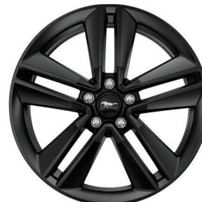
19" X 9" Ebony Black-painted Aluminum Included in EcoBoost® Performance Pkg. (67E)