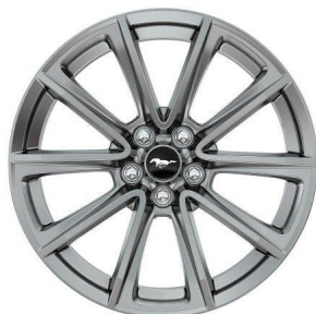
19" X 8.5" Premium Dark Stainless-painted Aluminum (648) Optional on GT Premium (400A/401A)