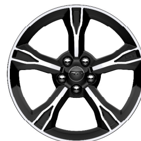
19" Ebony Black-painted Machined-Aluminum Included in California Special (54C)