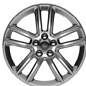
19" X 8.5" Polished Aluminum Included in Pony Package (54P)