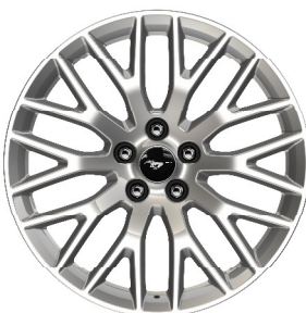
19" X 9" (F) 19" X 9.5" (R) Luster Nickel-painted Aluminum (64F) Optional Wheel Finish with GT Performance Package (67G)