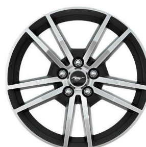
18" X 8" Magnetic-painted Machined-aluminum Standard on EcoBoost® (100A), EcoBoost® Premium (200A/201A), GT (300A) and GT Premium (400A/401A)