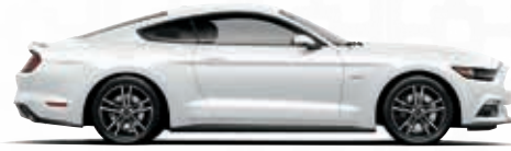
Oxford White (YZ)