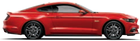
Ruby Red Tinted Clearcoat (1)(2) (RR)