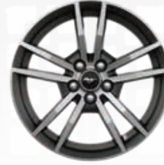
18" Machined Magnetic Painted Aluminum (Std. on EcoBoost Premium, GT and GT Premium)