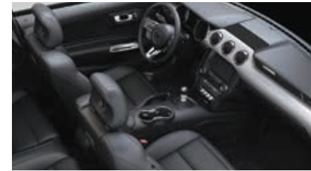
GT Premium Interior