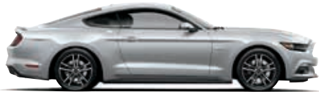
Ingot Silver (1) (UX)