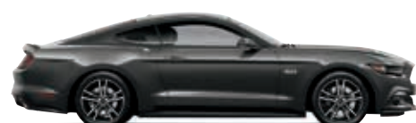
Magnetic (1) (J7)