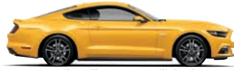
Triple Yellow Tri-coat (2) (H3)