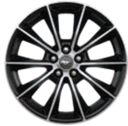
19" Low Gloss Black Painted and Machined Aluminum (Incl. in Wheel and Stripe Package)