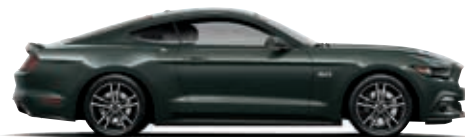
Guard (1) (HN)