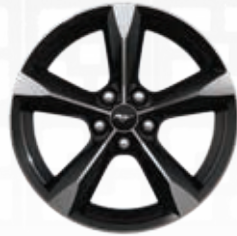
18" Foundry Black Painted Aluminum (Std. on V6 [051A], opt. on EcoBoost, EcoBoost Premium, GT and GT Premium)