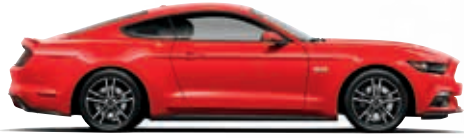
Race Red (PQ)