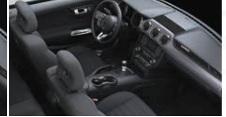
EcoBoost ® Interior