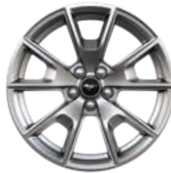
19" Premium Luster Nickel Painted Aluminum (Incl. in 50 Years Appearance Package)