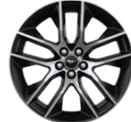
20" Machined Foundry Black Painted Aluminum (Opt. on EcoBoost Premium and GT Premium)