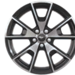
19" Machined Painted Aluminum (Incl. with 50 Years Limited Edition)