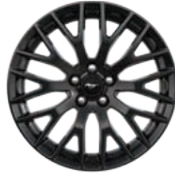
19" Ebony Black Painted Aluminum (Incl. in GT Performance Package)