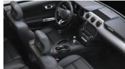
EcoBoost Premium Interior