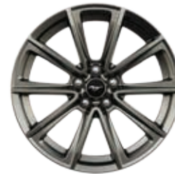
19" Premium Dark Stainless Painted Aluminum (Opt. on GT Premium)