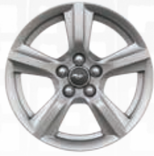
17" Sparkle Silver Painted Aluminum (Std. on V6 [050A] and EcoBoost®)