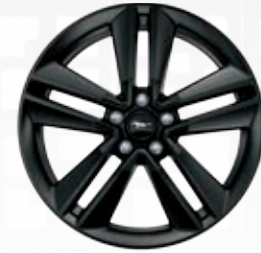
19" Ebony Black Painted Aluminum (Incl. in EcoBoost Performance Package)