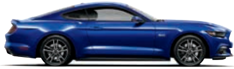
Deep Impact Blue (1) (J4)