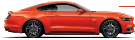
Competition Orange (CY)