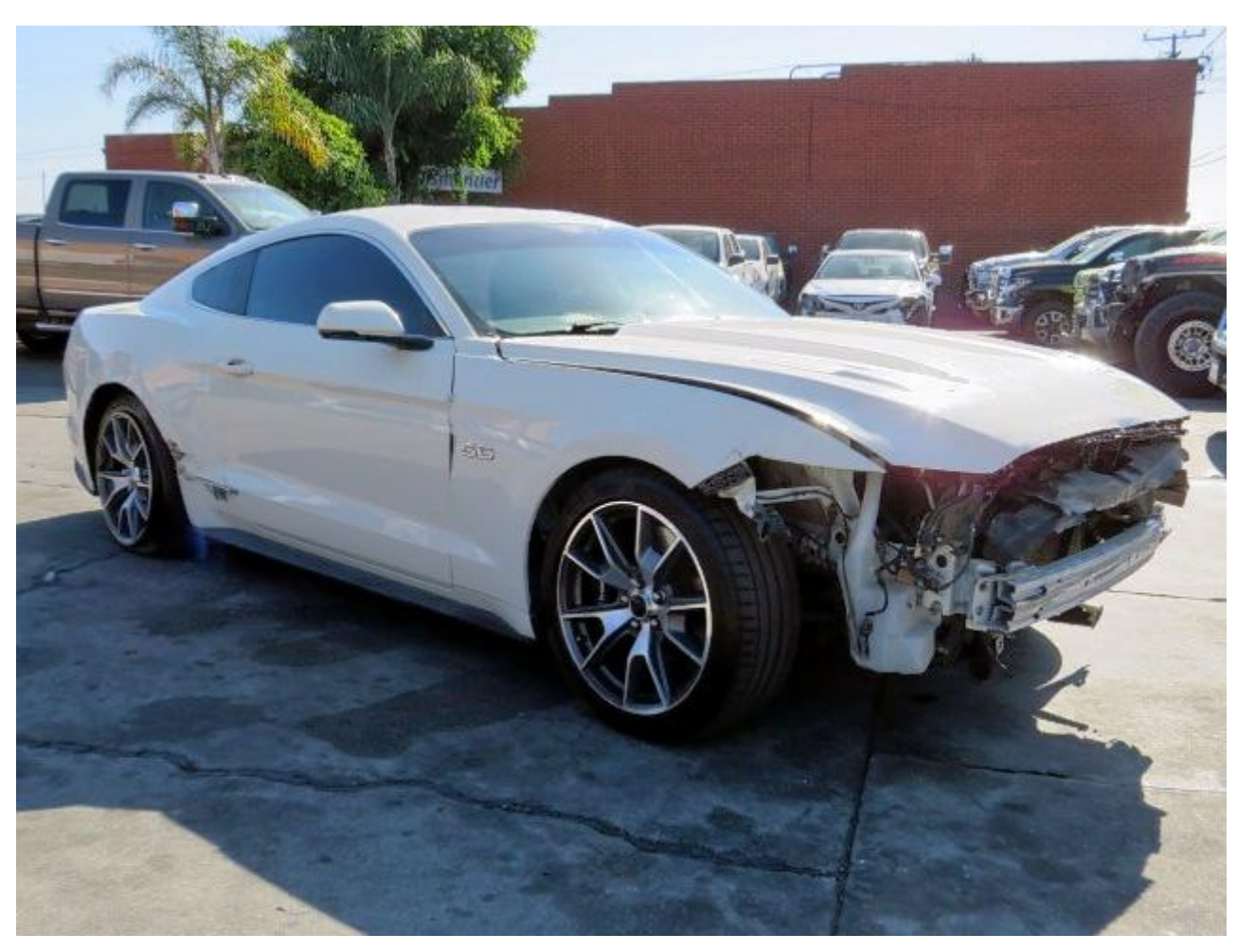
△ Back to Top | Lot Details ⊘