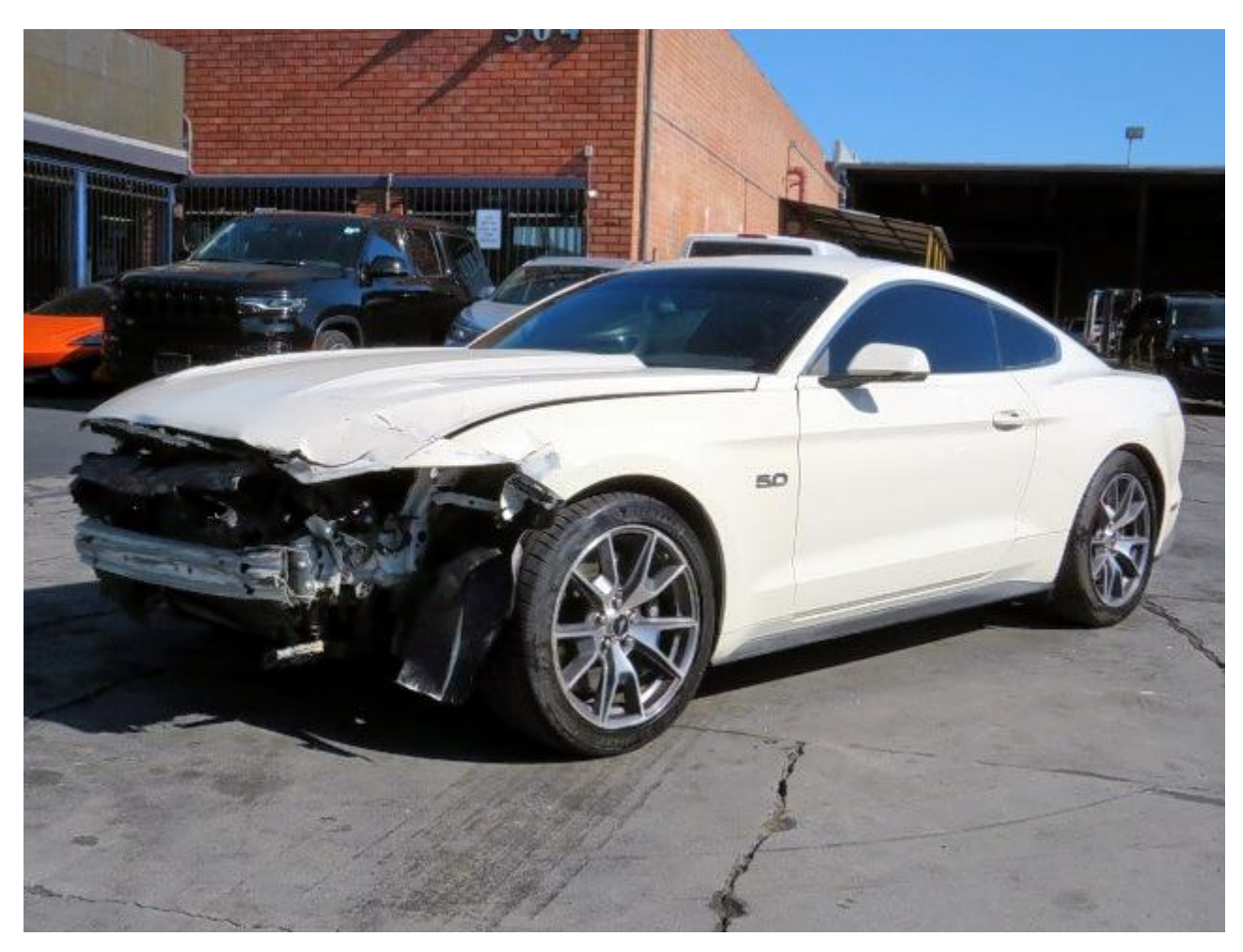
△ Back to Top | Lot Details ⊘