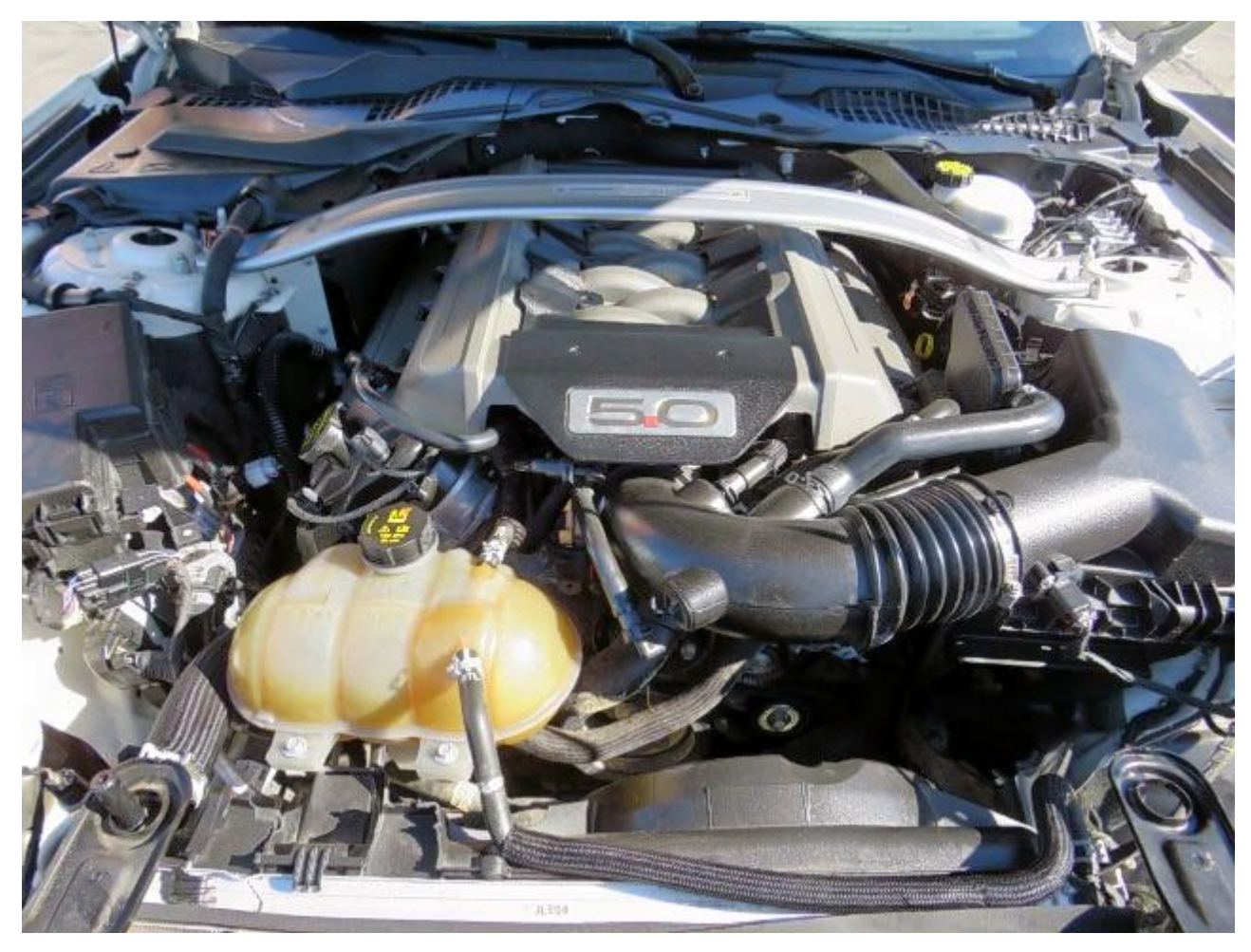
△ Back to Top | Lot Details ◇