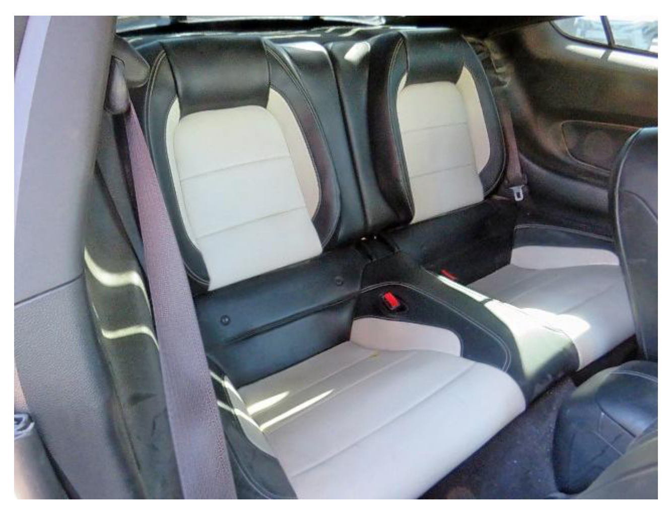
△ Back to Top | Lot Details ◆