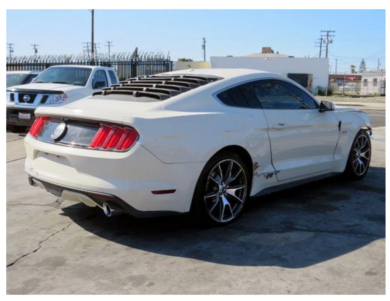
△ Back to Top | Lot Details ⊘