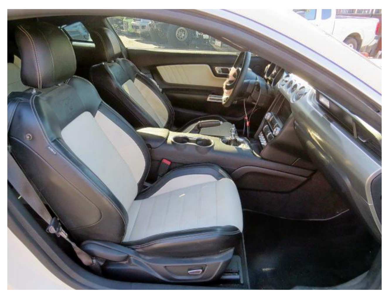
△ Back to Top | Lot Details ⊘