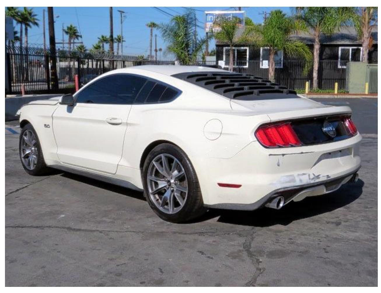
△ Back to Top | Lot Details ◆