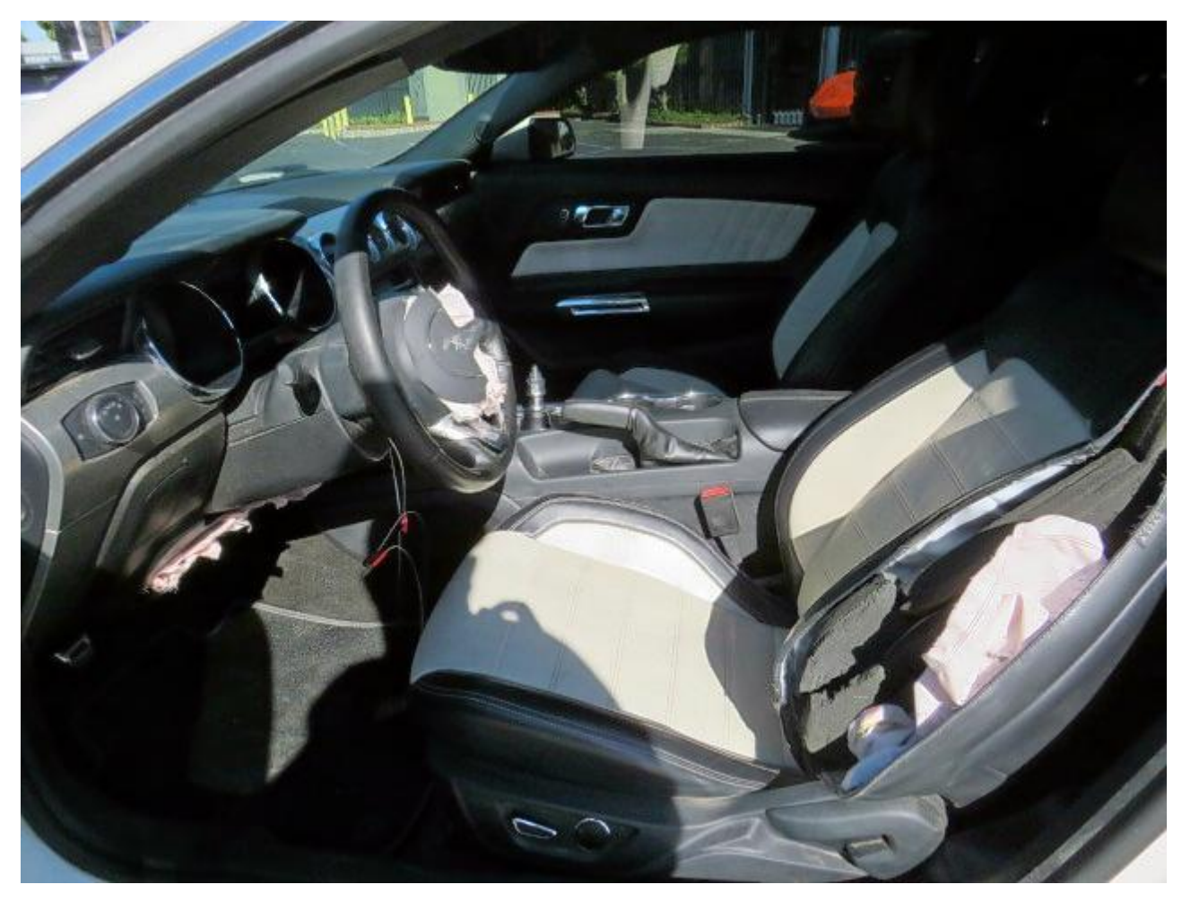
△ Back to Top | Lot Details ◆